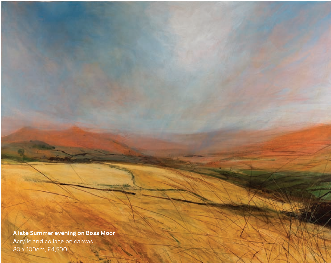
A late Summer evening on Boss Moor