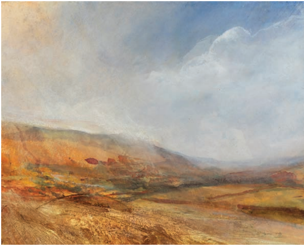
Heat haze on Boss Moor, looking towards Rylstone Fell, Watercolour, acrylic, ink, pastel and collage on paper 42 x 51.5cm, £1200