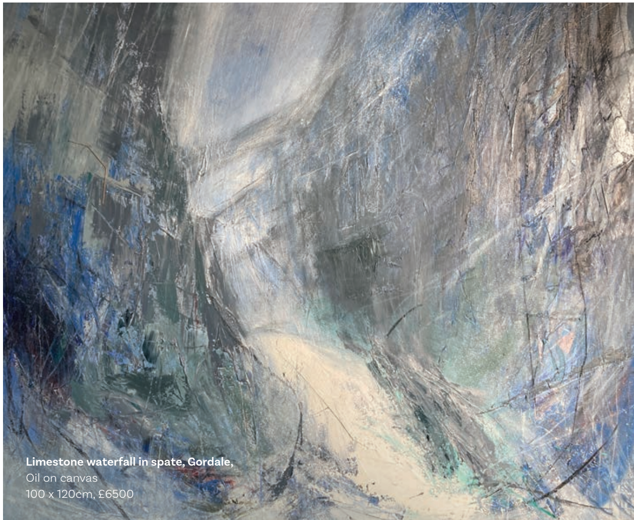
Limestone waterfall in spate, Gordale, Oil on canvas 100 x 120cm, £6500