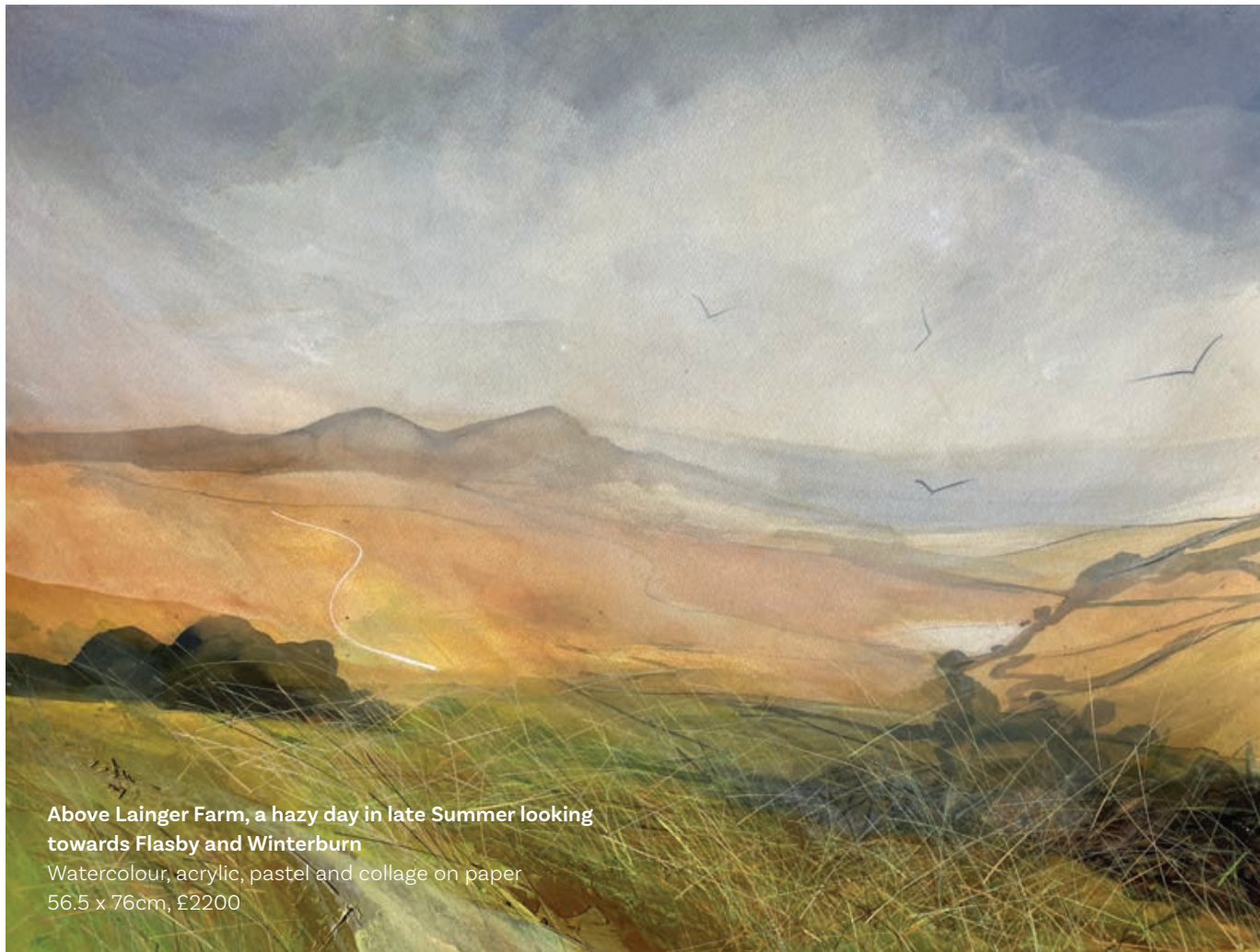
Above Lainger Farm, a hazy day in late Summer looking towards Flasby and Winterburn

Watercolour, acrylic, pastel and collage on paper 56.5 x 76cm, £2200