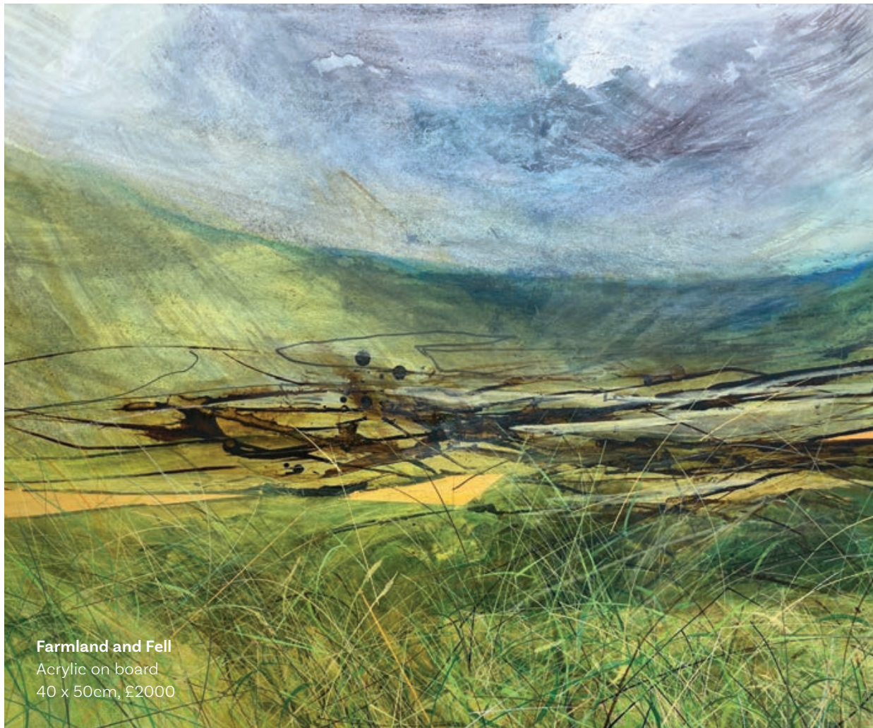
Farmland and Fell Acrylic on board 40 x 50cm, £2000