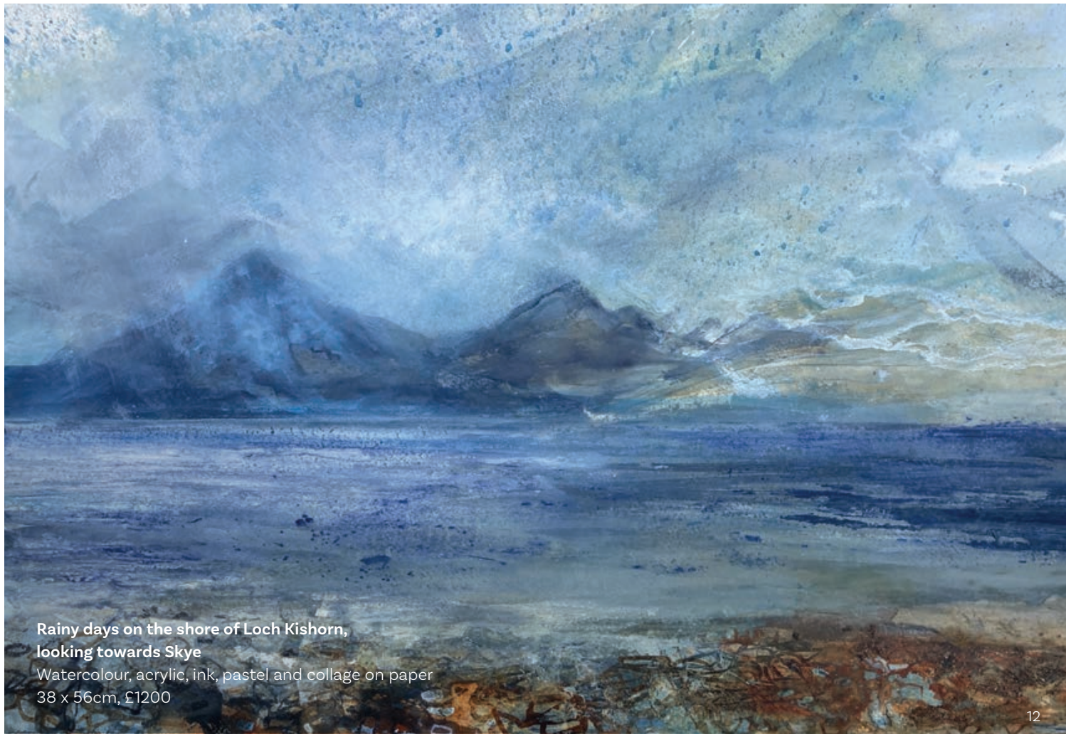
Rainy days on the shore of Loch Kishorn, looking towards Skye Watercolour, acrylic, ink, pastel and collage on paper 38 x 56cm, £1200